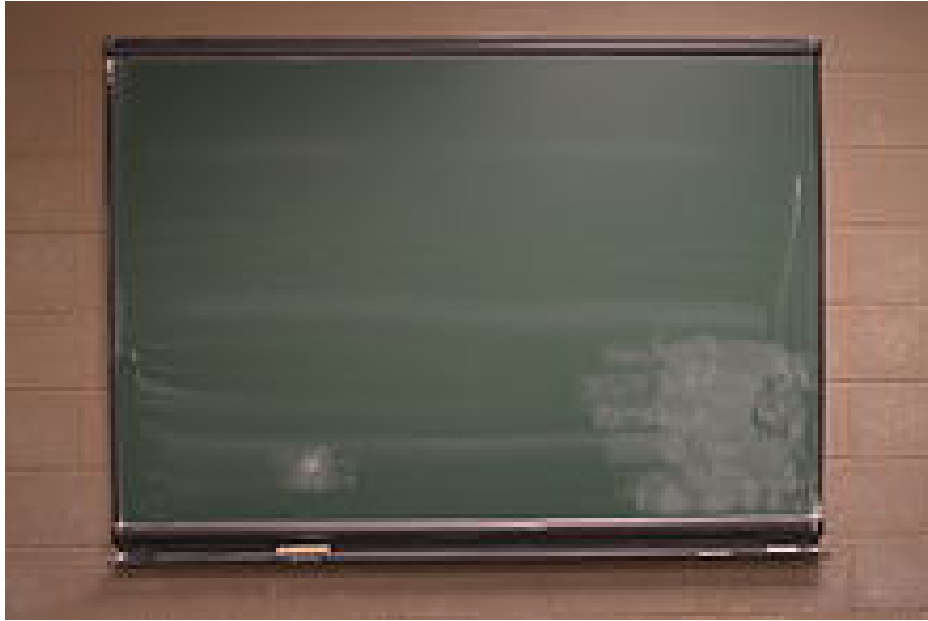
Figure 1. A modern green chalk.