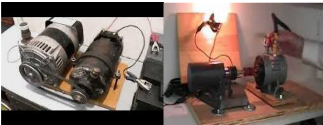
Figure 3: System Coupling.

The alternator can be loaded only when the system has gained momentum.